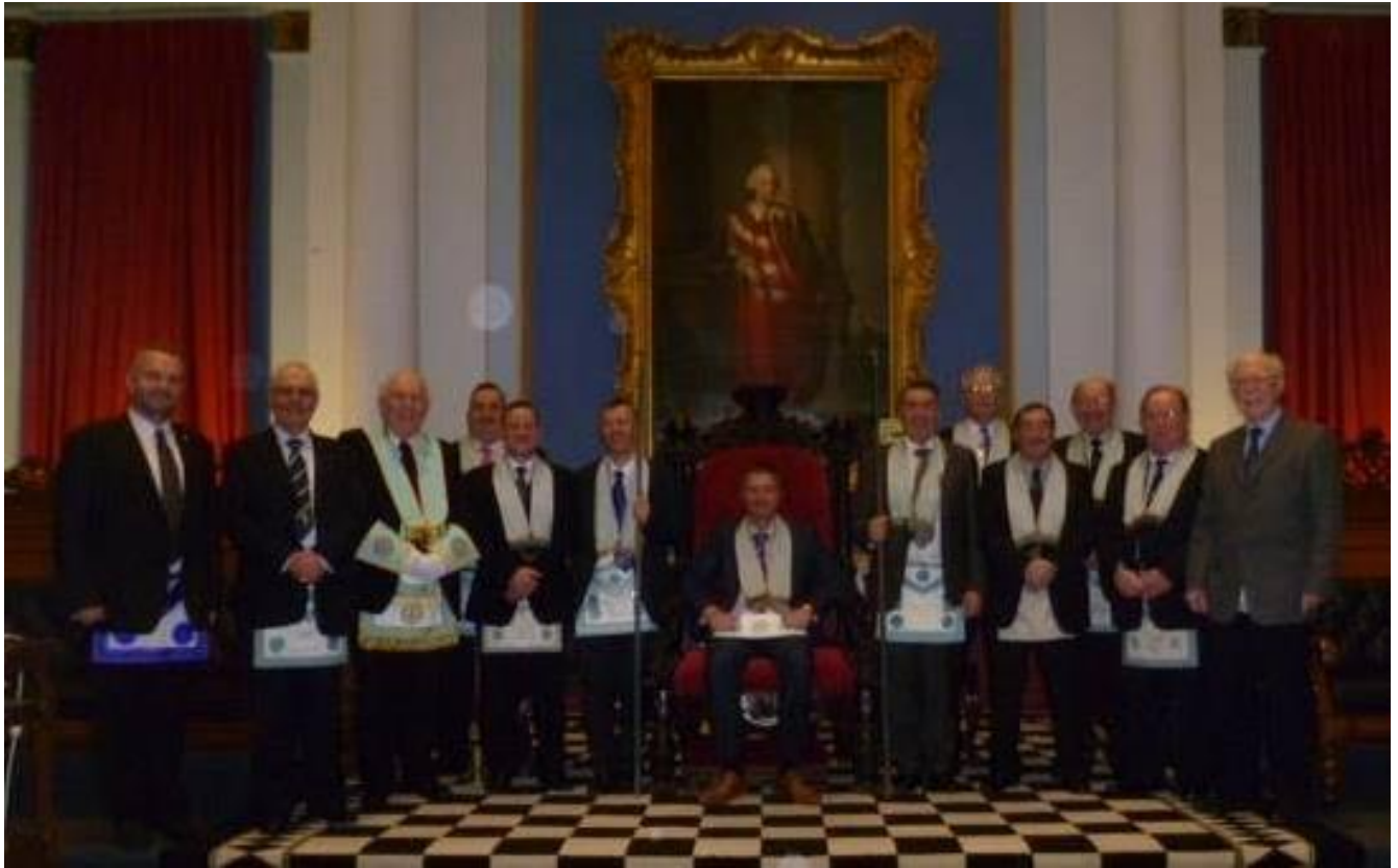
Members of Royal Larne Lodge No 615 who held their November Communication in Dublin