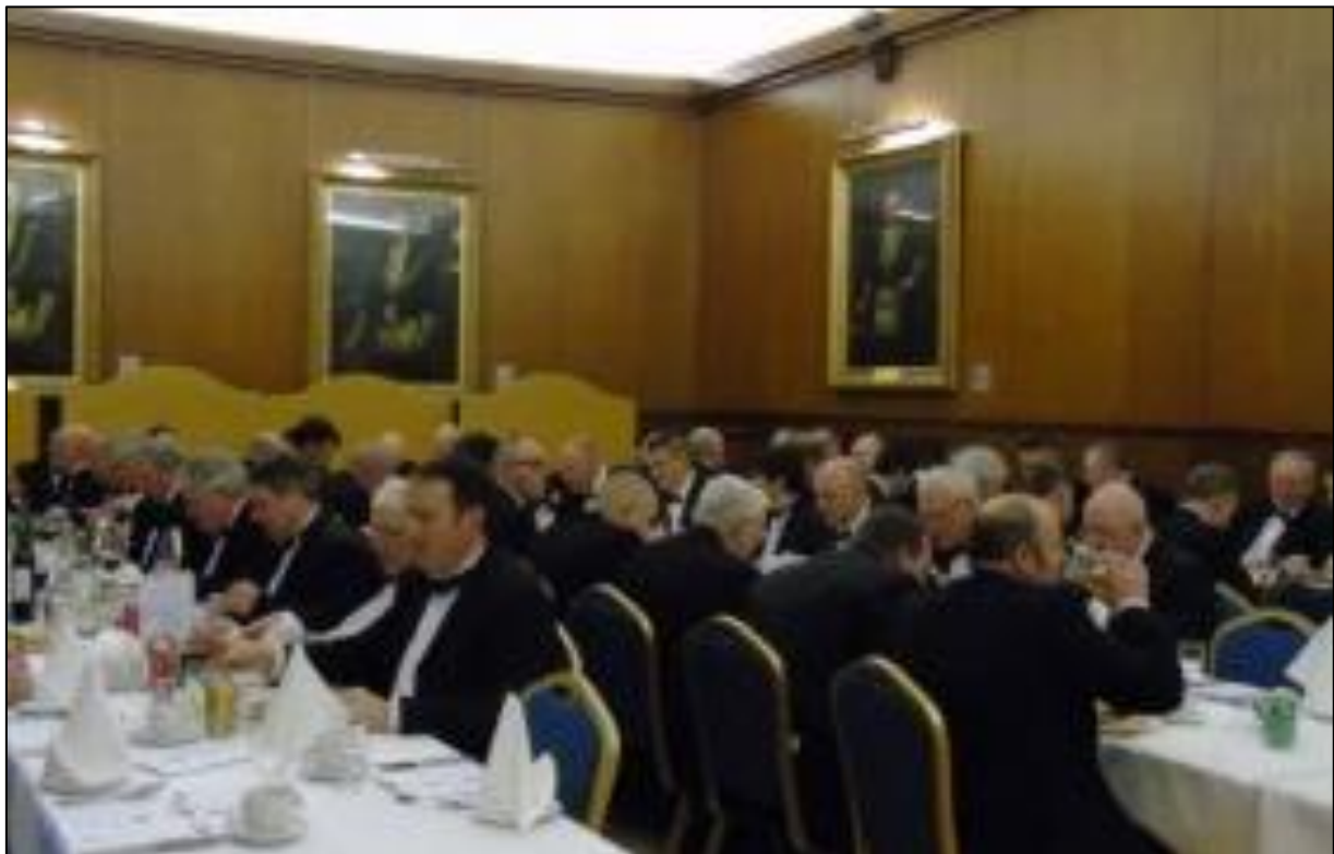
Brethren and Guests enjoy the Installation Dinner

For further information visit the Lodge website – see link on.net section of PGL website